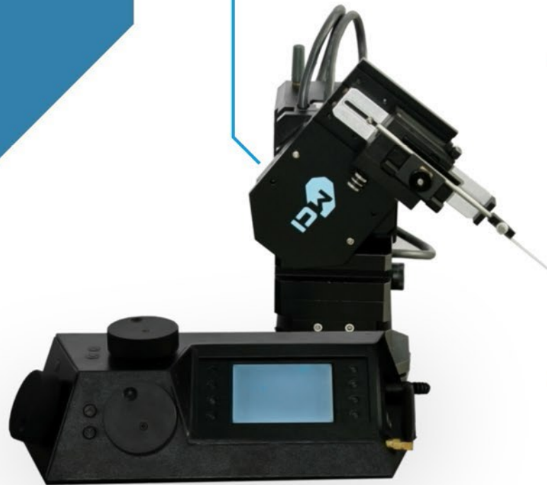
Cleverarm with CleverControl Cuboid ( Left-handed Configuration )

"Electrode Extension Plate" as helping the Arm increase another dimension of freedom.